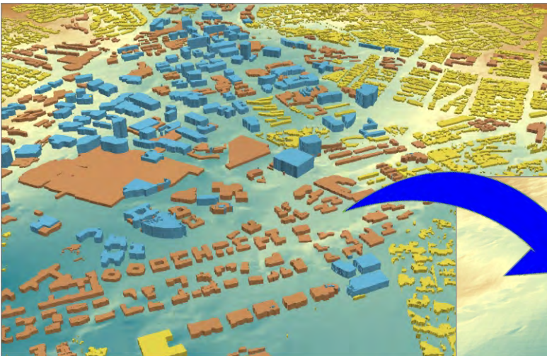
Terrain with buildings